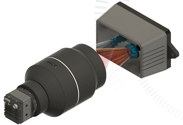
APPLICATION FOR QUALITY INSPECTION

In order to reliably detect small objects at a distance of more than 100 meters, it must be ensured that transmitting and receiving units are optimally adjusted to each other. Take advantage of our years of experience in designing complex optical systems and get a conoscope with precise beam steering and minimal pupil aberration, ensuring that corresponding angles of the transmitter and receiver unit actually impinge on the camera at the same pixel location.